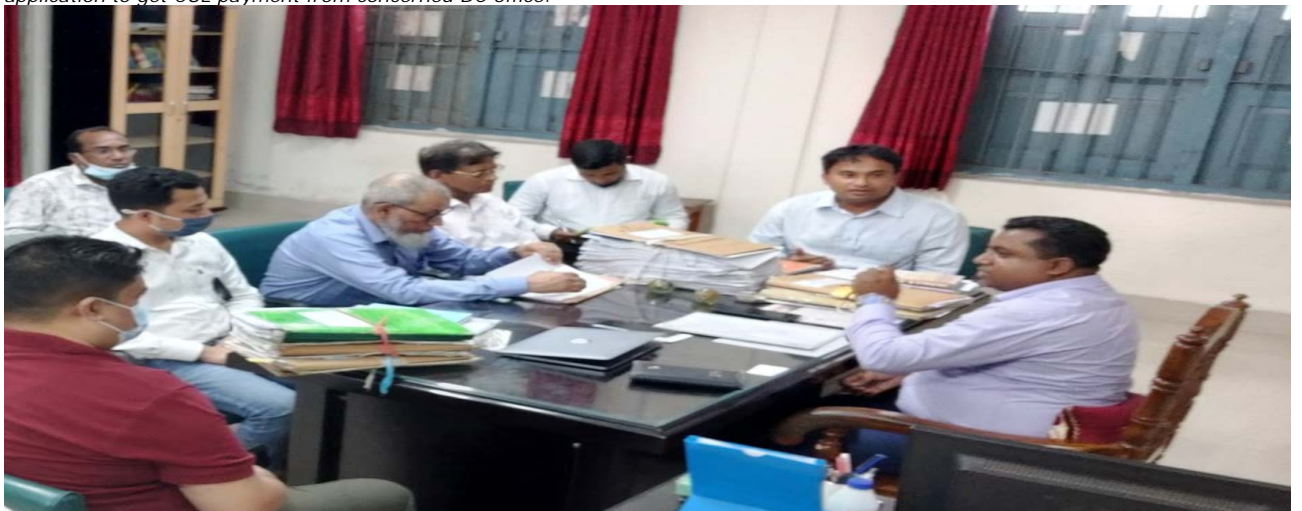
Photo 4: Meeting with ADC (Revenue and LAO), Patuakhali in presence of WB Team & PMU officials regarding toLA issues and payment of CUL of Polder-43/2C, 47/2 & 48.