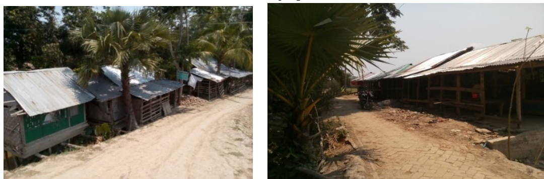
Photo 14: Market Relocation for Anando Bazar, Razapur at Polder 35/1