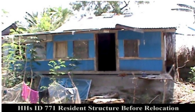
HHs ID 771 Resident Structure Before Relocation Photo 17:HH 771 before relocation in Polder-40/2