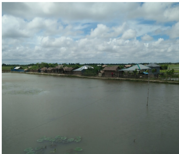
Photo 8: Group Relocation site: Meeting at CEIP Village, Uttar Kamarkhola under Polder-32