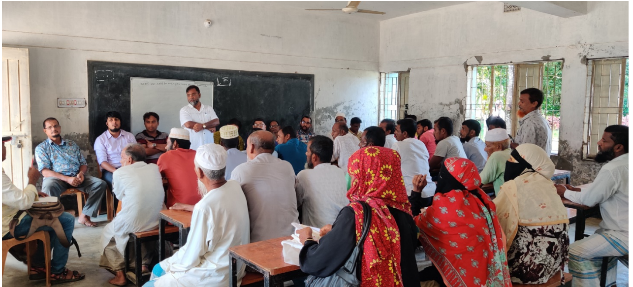
Photo 3: Meeting with awardees at Choto-Shewla mouza of Polder-39/2C in presence of WB Team & PMU officials for submission of application to get CUL payment from concerned DC office.