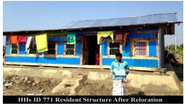
HHs ID 771 Resident Structure After Relocation Photo 18:HH 771 after relocation in Polder-40/2