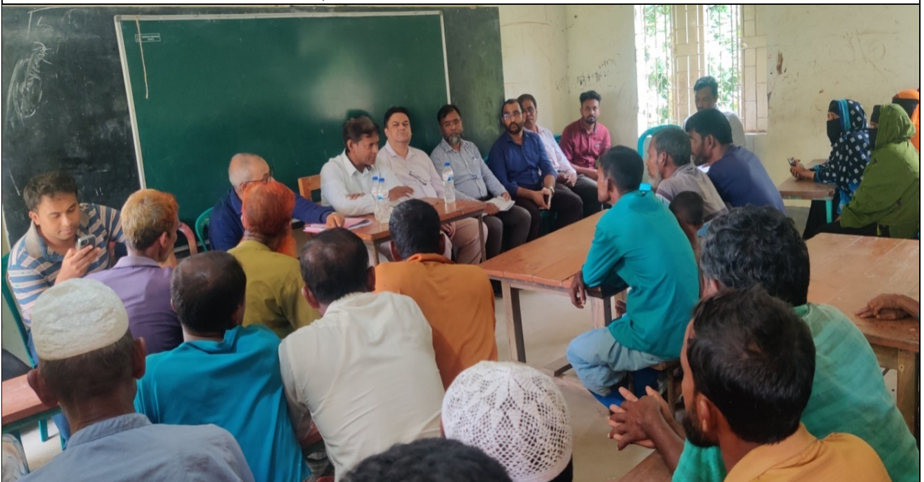
Photo 16: Meeting with relocated Squatters at Dakhin Charduani of Polder-40/2 in presence of WB Team & PMU officials.