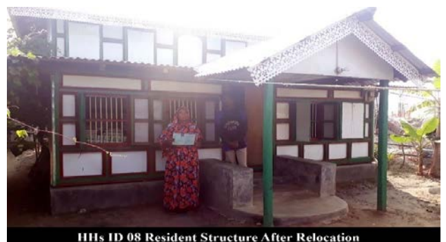
HHs ID 08 Resident Structure After Relocation Photo 24:HH 08 after relocation in Polder-48