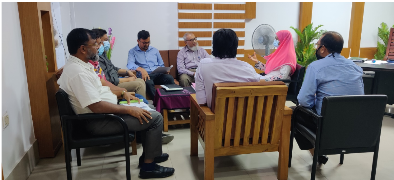
Photo 6: Meeting with ADC, Khulna in presence of WB & PMU officials regarding expedite the CUL payment of Polder-32 & 33.