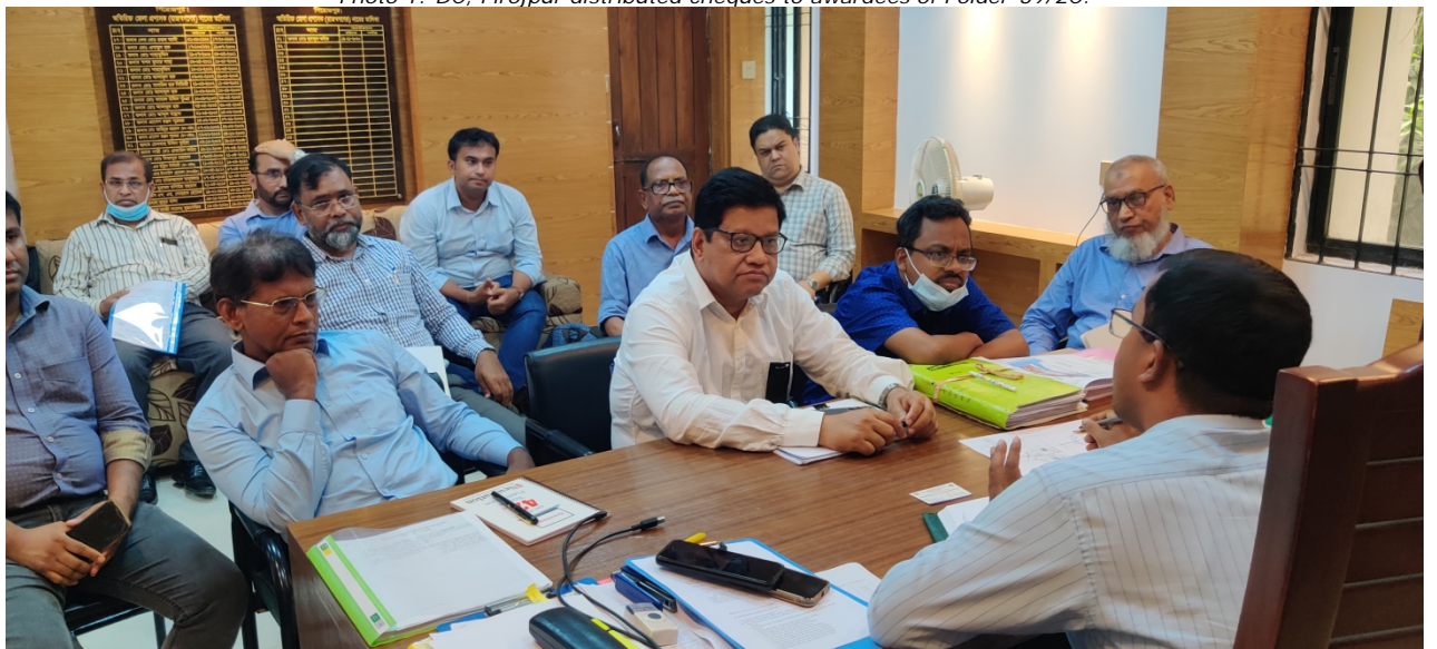
Photo 2: Meeting with ADC & LAO, Pirojpur in presence of PD, CEIP-1, WB Team, regarding to expedite the CUL payment of Polder-39/2C.