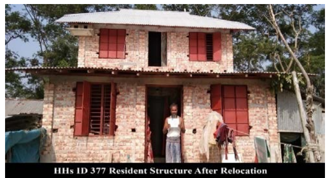
HHs ID 377 Resident Structure After Relocation Photo 20:HH 377 after relocation in Polder-41/1