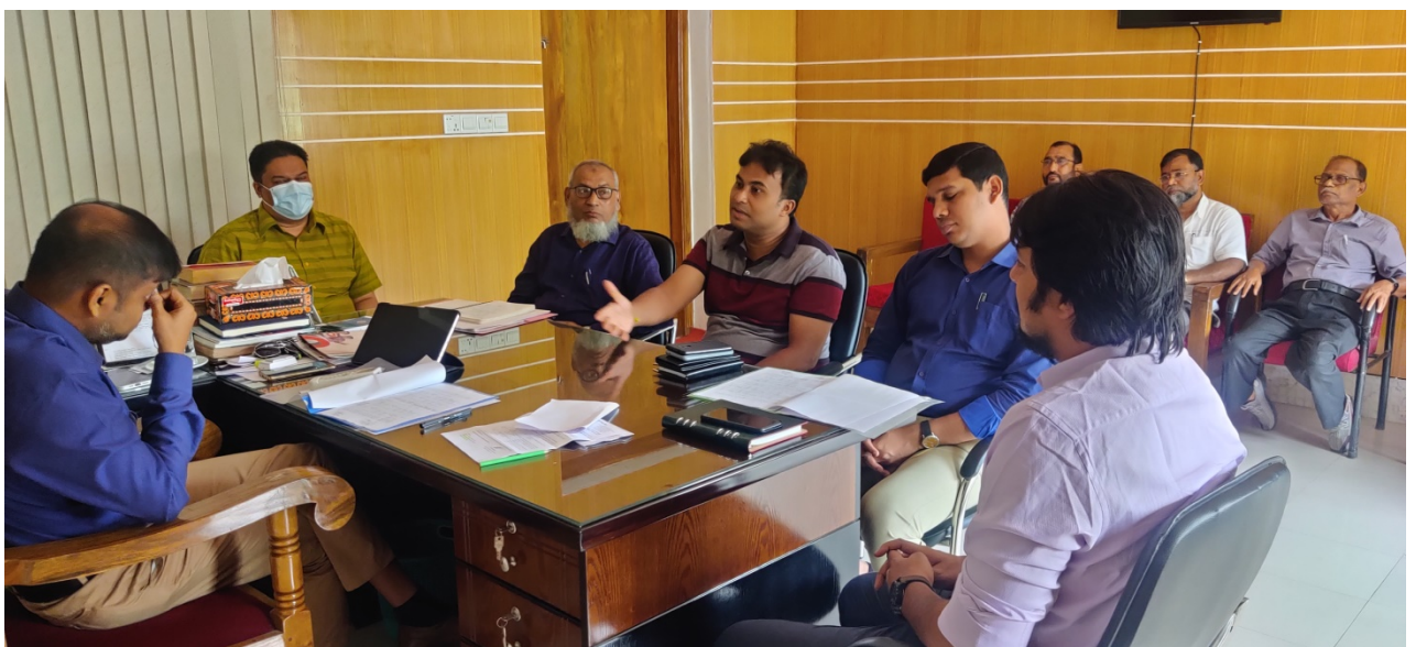
Photo 5: Meeting with ADC & LAO, Jhalakati in presence of WB Team & PMU officials regarding to expedite the CUL payment of Polder-39/2C (Jhalakathi District).