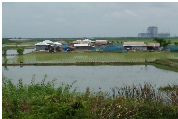
Photo 9: Group Relocation site: Chunkuri (Dangapara) CEIP-1 Resettlement Village under Polder-33