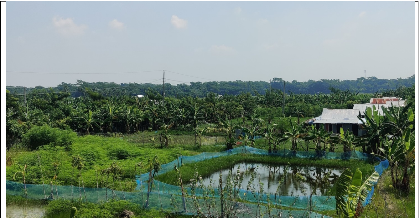
Photo 15: Group relocation site of Dhakin Charduani of Polder 40/2