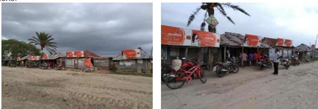
Photo 12: Relocation site at Mollikerber Madrasha Bazar in Polder-35/3

Business owners are encouraged for relocating their business concerns in a cluster market at the locations nearby of the affected market. The following photographs show the new market locations.