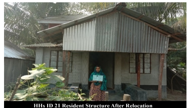
HHs ID 21 Resident Structure After Relocation Photo 22:HH 21 After relocation in Polder-43/2C