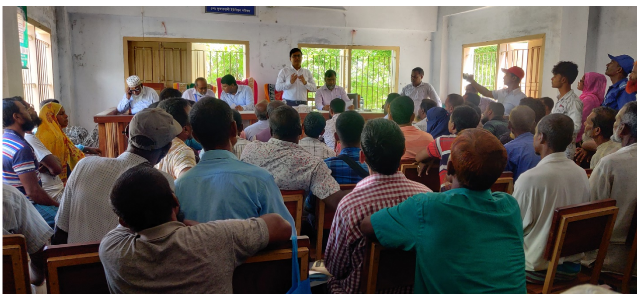
Photo 7: Consultation Meeting with titled land owner at Suterkhali UP of Polder-32 in presence of DC officials.