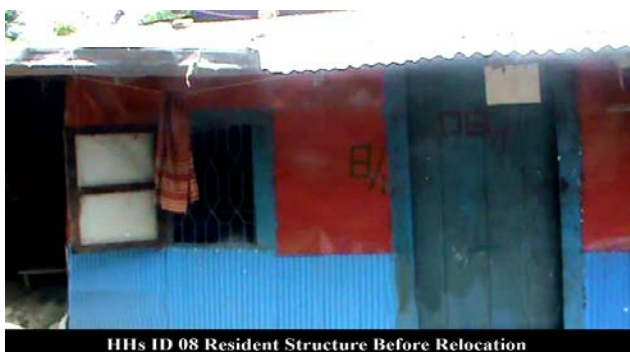
HHs ID 08 Resident Structure Before Relocation Photo 23:HH 08 before relocation in Polder-48