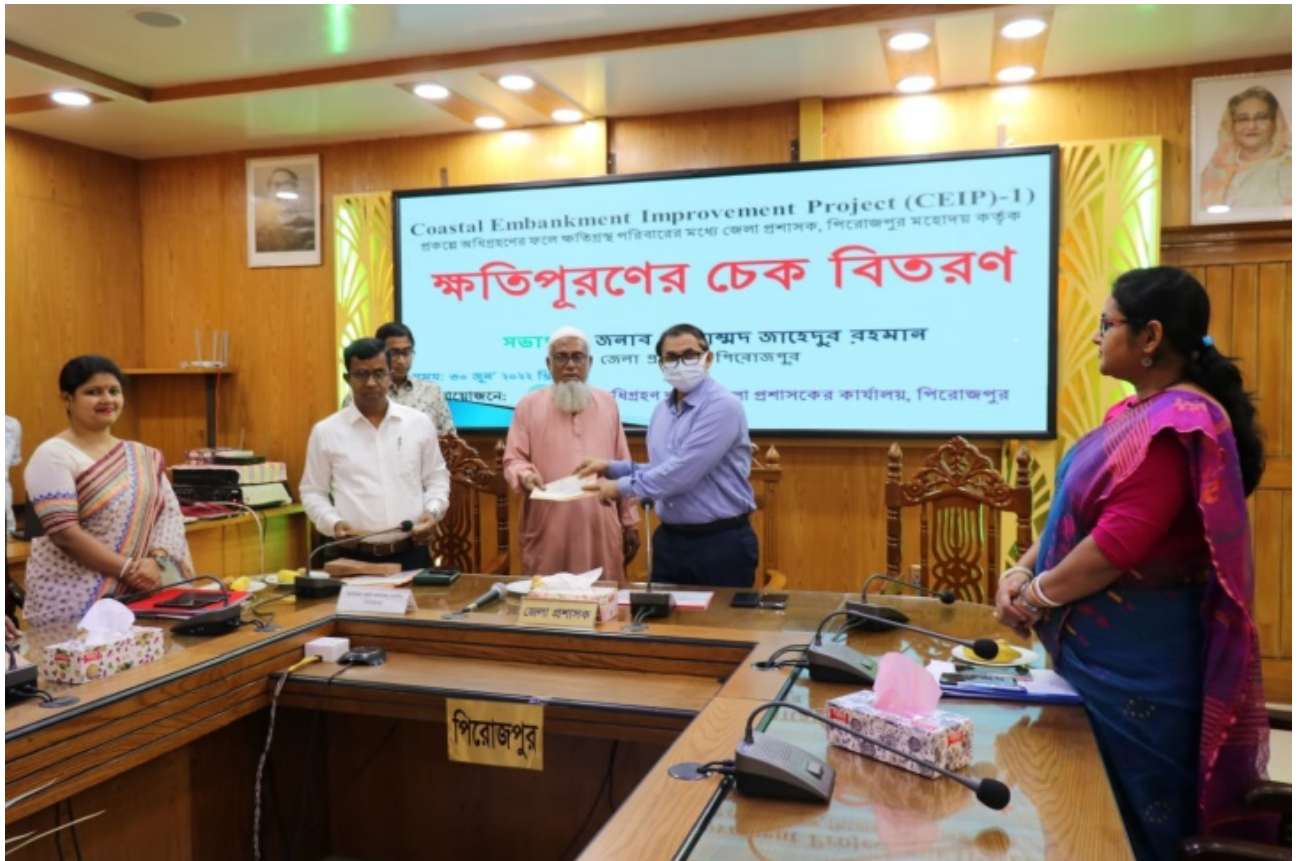
Photo 1: DC, Pirojpur distributed cheques to awardees of Polder-39/2C.