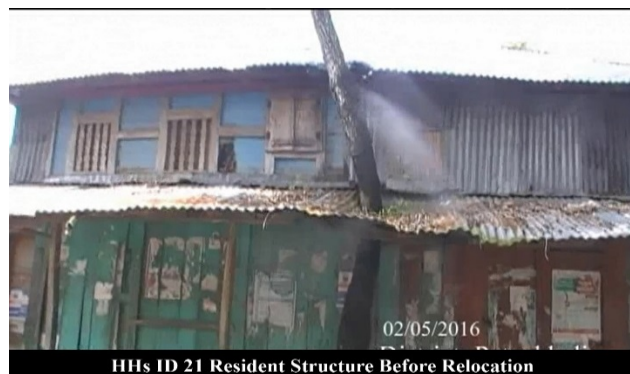
HHs ID 21 Resident Structure Before Relocation Photo 21:HH 21 before relocation in Polder-43/2C