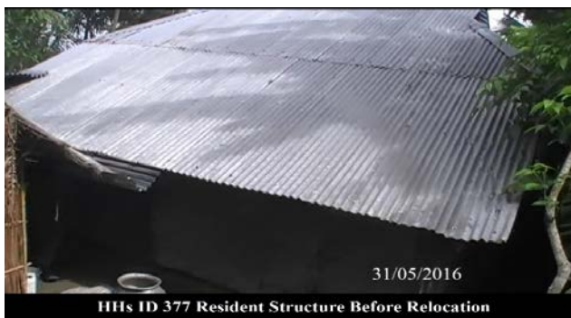
HHs ID 377 Resident Structure Before Relocation Photo 19:HH 377 before relocation in Polder-41/1